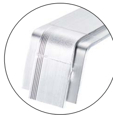
Clip connector for simple fastening