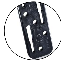
Main casting made of high-quality polyamide plastic