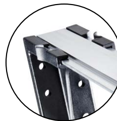
Infinitely adjustable thanks to tension springs