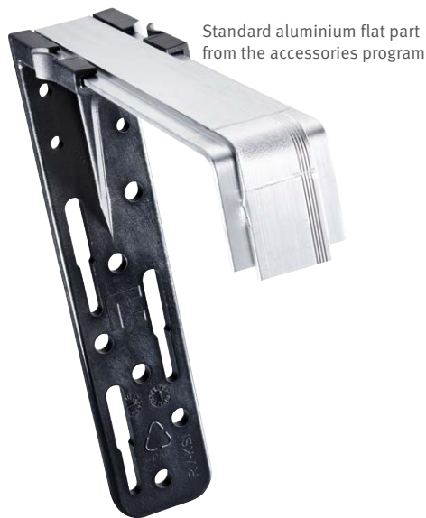
Standard aluminium flat part from the accessories program